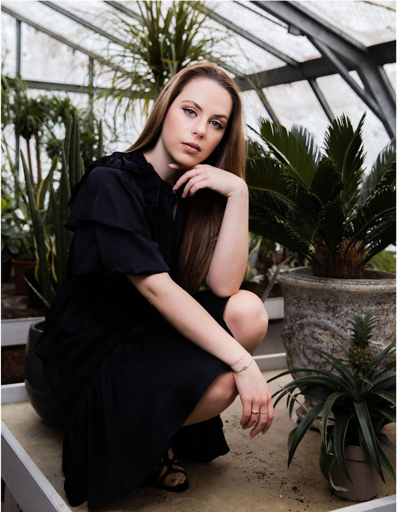
Black Dress - Munthe Shoes - Zara